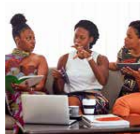
Meet & Greet